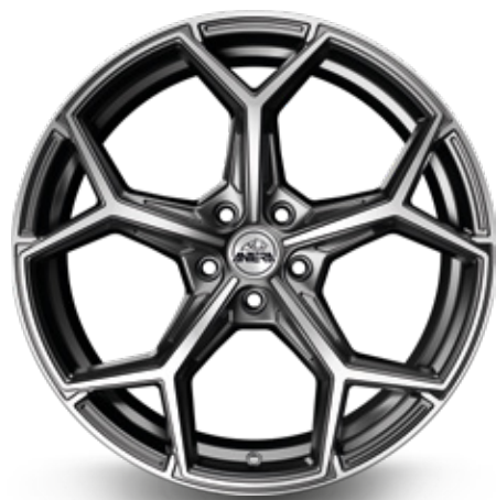
Moon Grey Diamond