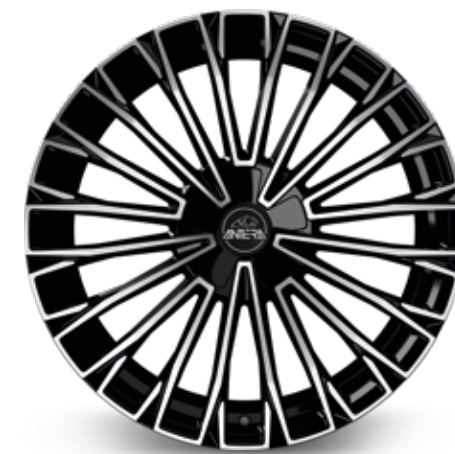
Piano Black Diamond