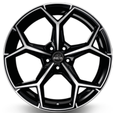
Piano Black Diamond