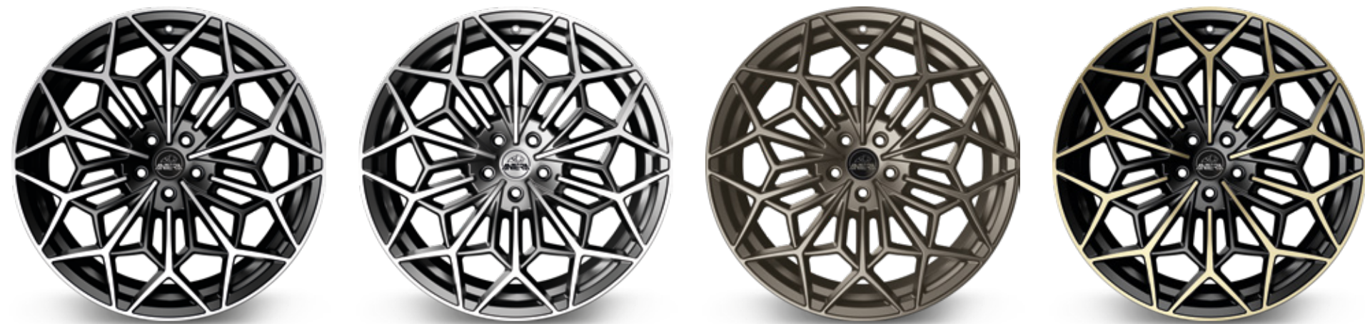
Piano Black Diamond