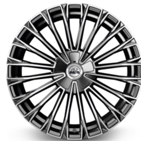
Moon Grey Diamond